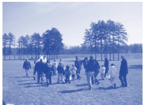
We Love a Parade!